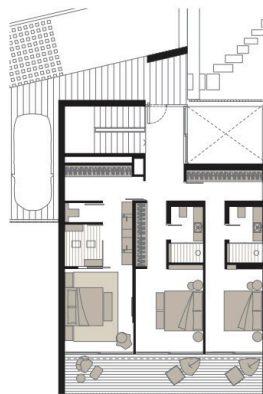
Planta piso (1)

REAL ESTATE PARADISE MALLORCA SLU | B57854432