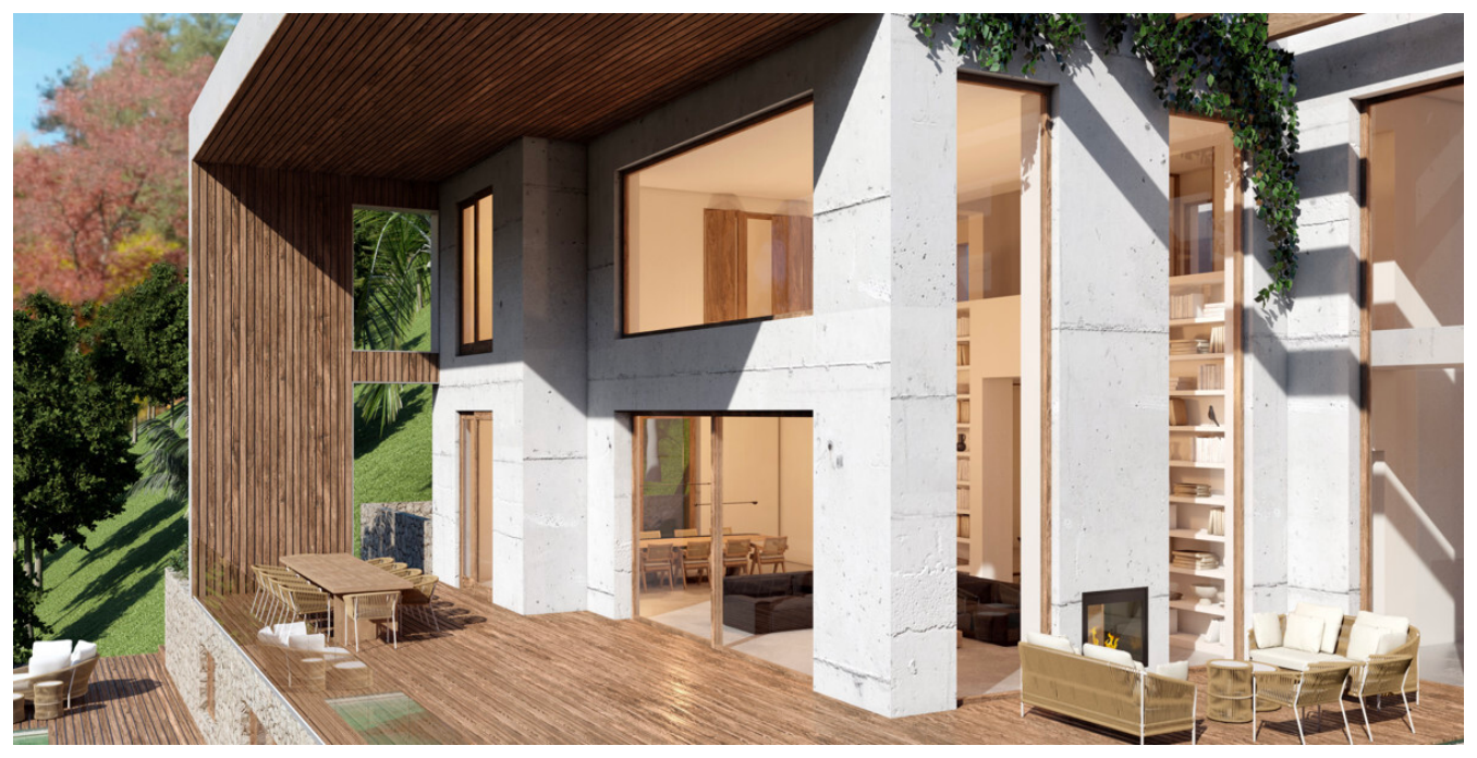
Property: JJ-466 | 07013 Son Vida

Type of property Property type House Villas / Houses Villa Kind of property Living area 1.070 sqm Type of use Plot surface 2.000 sqm Housing Energy certificate Type of in process Buy Purchase price 15.000.000€ commercialization