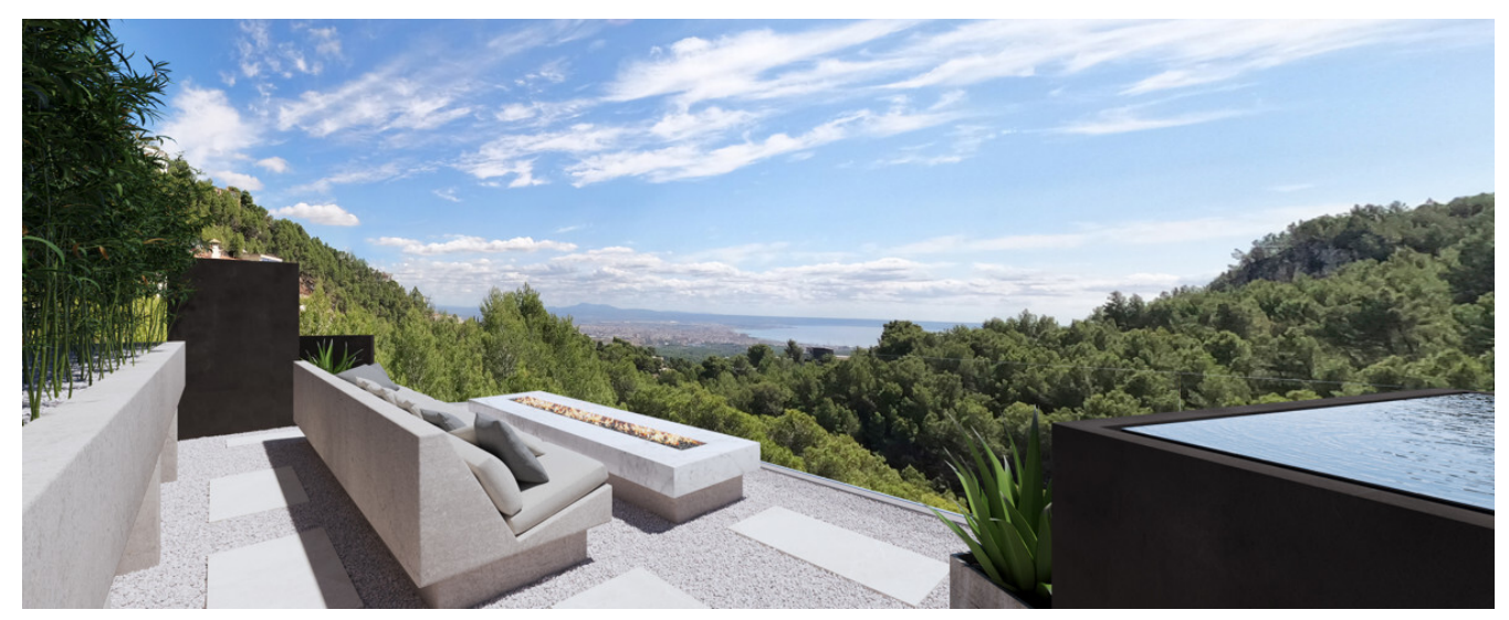
Property: JJ-244 | 07013 Son Vida