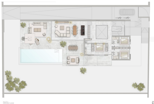
VILLA A GROUND FLOOR