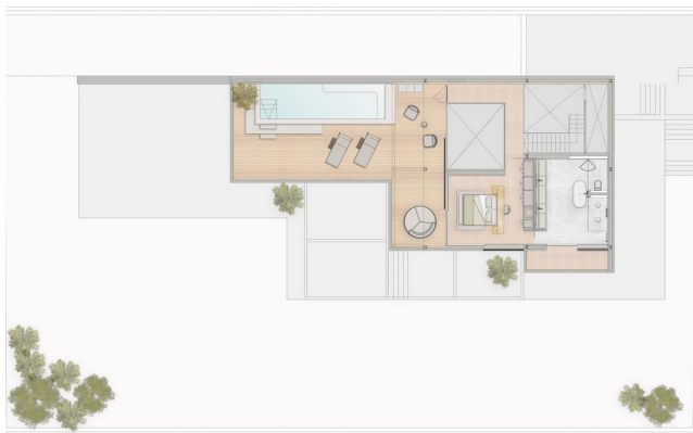
VILLA A FIRST FLOOR